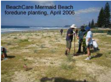
BeachCare Mermaid Beach foredune planting, April 2006

Club members are encouraged to participate and help preserve our beach.