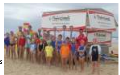
Mermaid Beach trailer with sponsorship signage