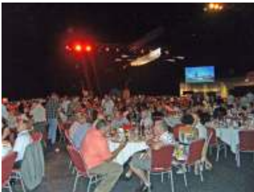
Across the Luncheon floor