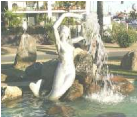
Merlina in 2003